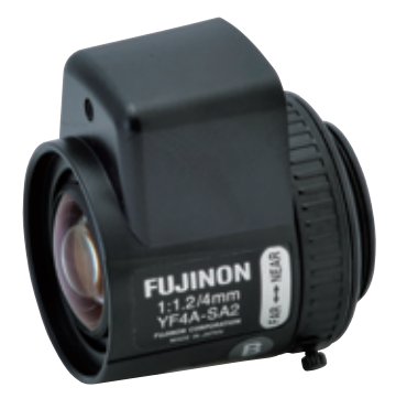
* Photograph is a similar model.